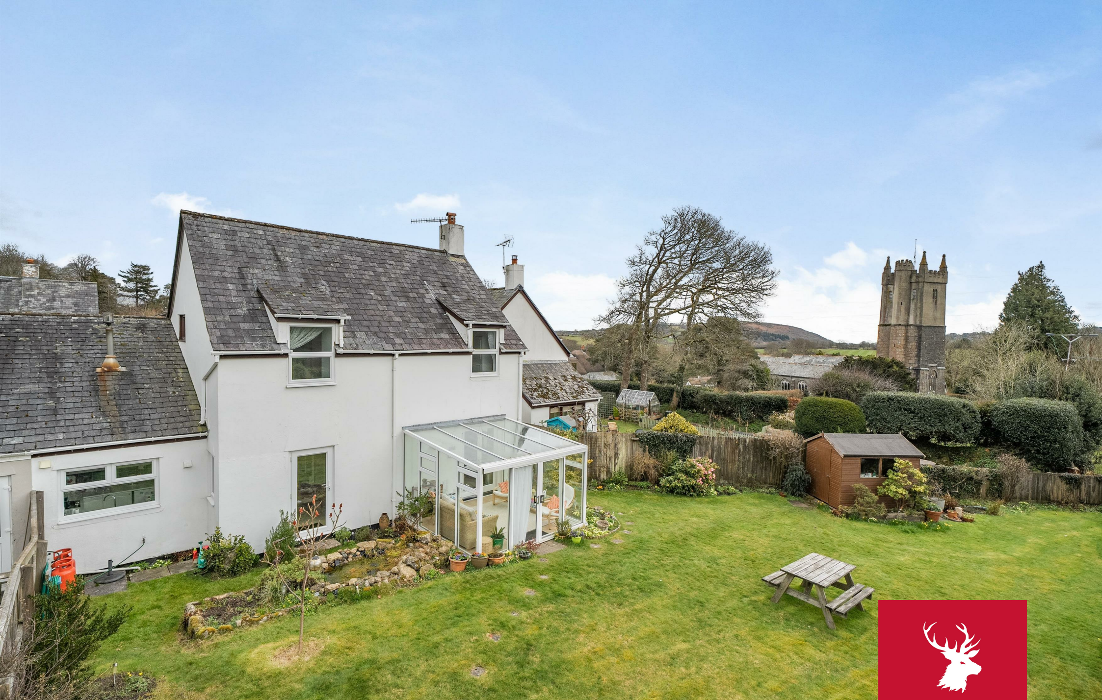
3, Greenawell Close